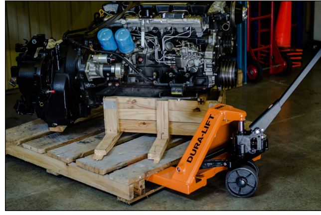
5,500 lb capacity