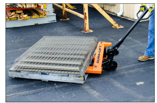
Fork leveling through adjustable push rods