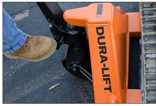
Foot pedal lowering valve